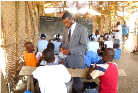
Principal of one of our Haitian Schools passes out the few supplies available.